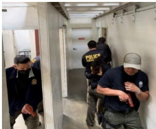
OEE Special Agents participating in a tactical training exercise