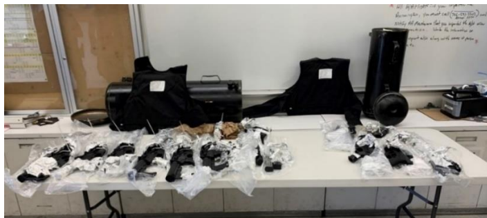
X-ray photo and photo of firearms concealed within air tanks, intercepted by Special Agents prior to their intended export