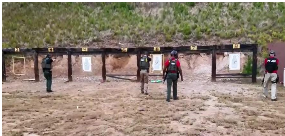
OEE Special Agents training at an outdoor firing range

forfeiture of three commercial properties appraised at over $2,000,000, and a $100 special assessment. On October 1, 2020, IC Link was sentenced to a $200,000 criminal fine and a $400 special assessment. On October 1, 2020, Alamdari was sentenced to a $5,000 criminal fine and a $100 special assessment. On March 6, 2023, BIS issued Mohamadi and Shaneivar post-conviction denial orders for a period of 10 years.