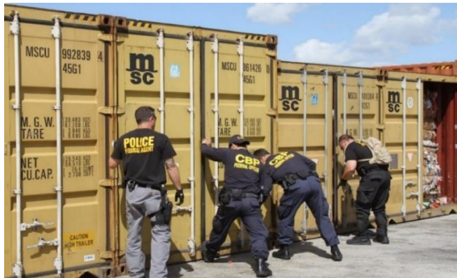
OEE Special Agents conducting an inspection

Fast-forward to the aftermath of September 11, 2001, and the focus of our country’s national security efforts pivoted to face a new and pressing threat of the terrorist attacks on our homeland by non-state actors like al-Qaeda. The changing nature of the threat meant OEE, in addition to investigating the proliferation of WMD and destabilizing military activities, also worked more closely with the Department of Defense to prevent U.S. components from getting into the hands of terrorists for use in improvised explosive devices. In parallel, we expanded the use of our Entity List to allow for the designation of parties when supporting any activity contrary to U.S. national security or foreign policy interests.