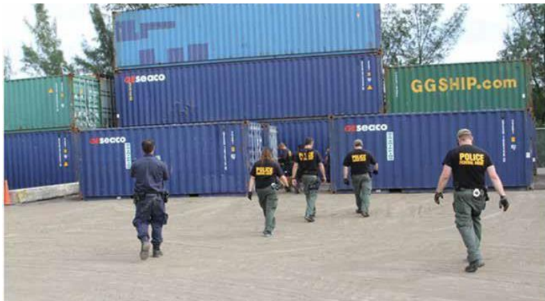
OEE Special Agents conducting inspections with U.S. Customs and Border Protection Officers

The Penalty: On June 9, 2021, Wu was sentenced to 52 months in prison (time served) and a $100 special assessment (suspended). In July 2022, Wu was deported from the United States. On December 1, 2022, BIS issued Wu a post-conviction denial order for a period of 10 years.