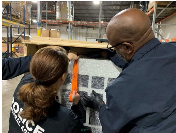
OEE Special Agents effecting a detention